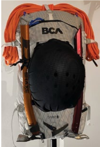
Dual Ice axes with helmet in lower position and rope