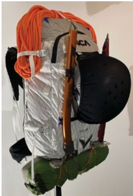
Tent strapped to bottom of bag with small web loops along bottom edge of bag. Useful for carrying bulky items or overnight multi-day trips