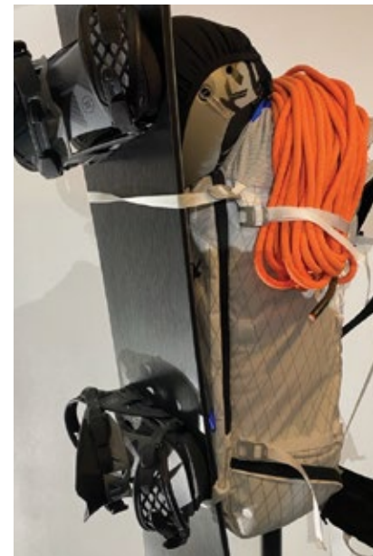
Vertical SNB carry with helmet in upper position and rope - right