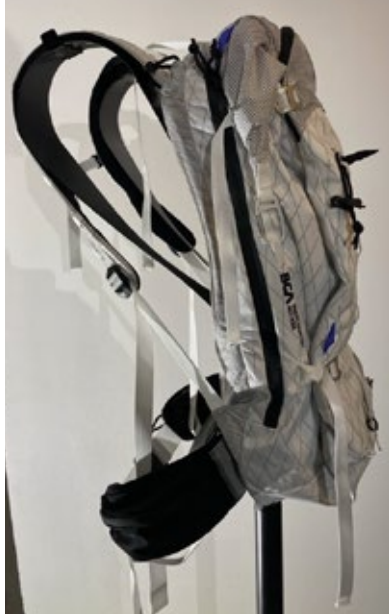
Side straps moved to front panel for max compression