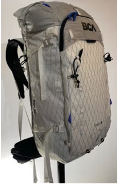
Full internal volume