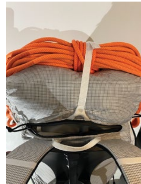
Top external access accessory pocket with key clip - accessible with rope strap in use