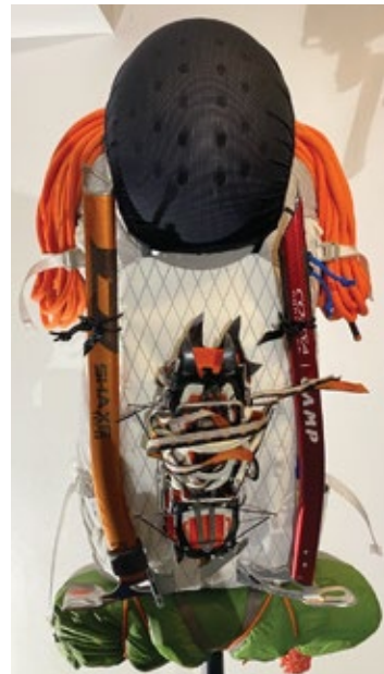
Multiple items strapped to outside including crampons, ice axes, and tools clipped to loops on waist belt.