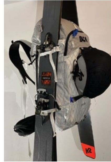
A-frame ski carry