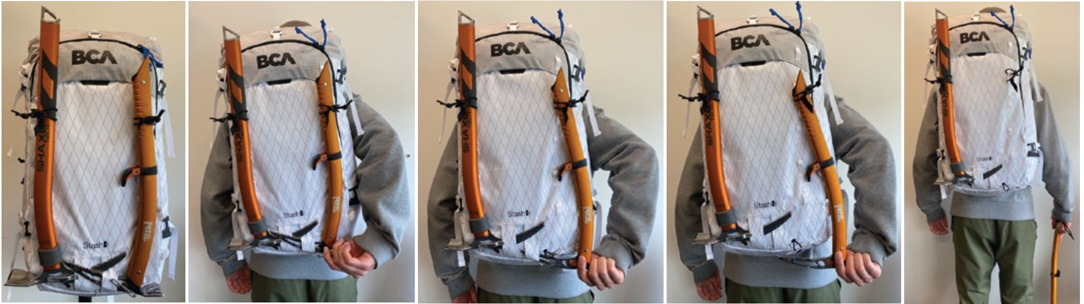
Dual Ice axe carry - accessible with pack still on