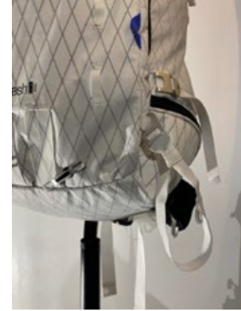
Angle ski carry lower loop