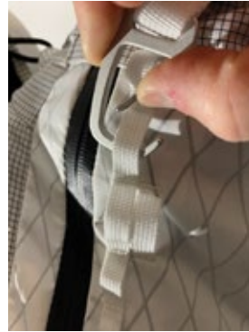
Roll top carabiners designed to reduce catching on web