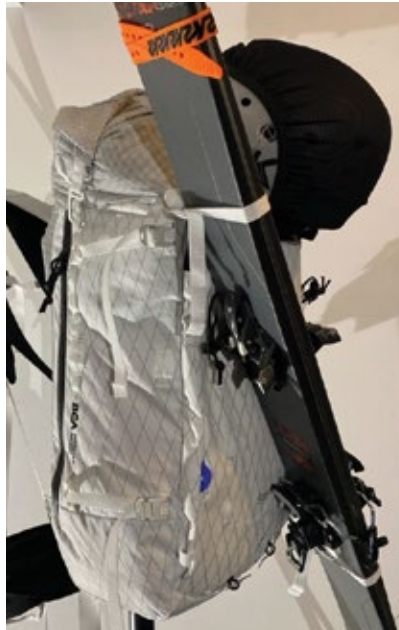
A-frame ski carry with helmet in upper position