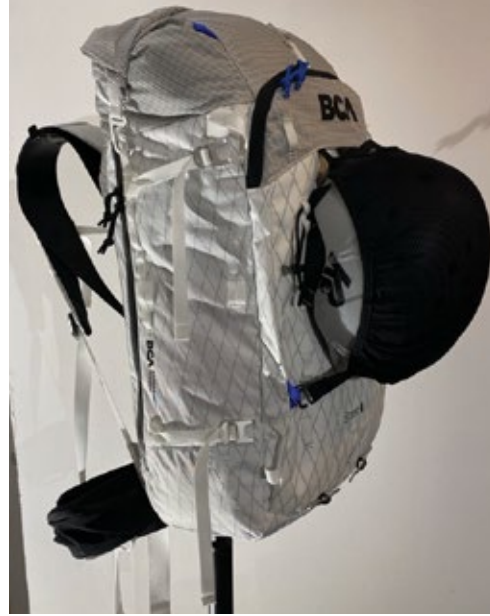
Helmet carry - front panel