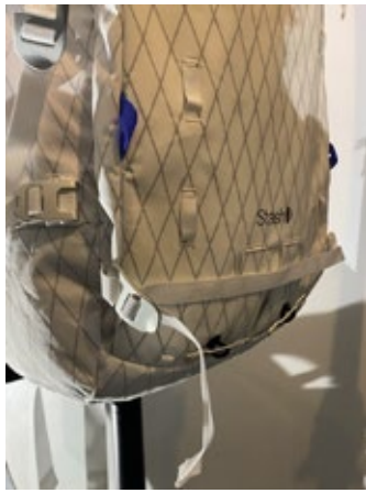
SNB carry lower strap