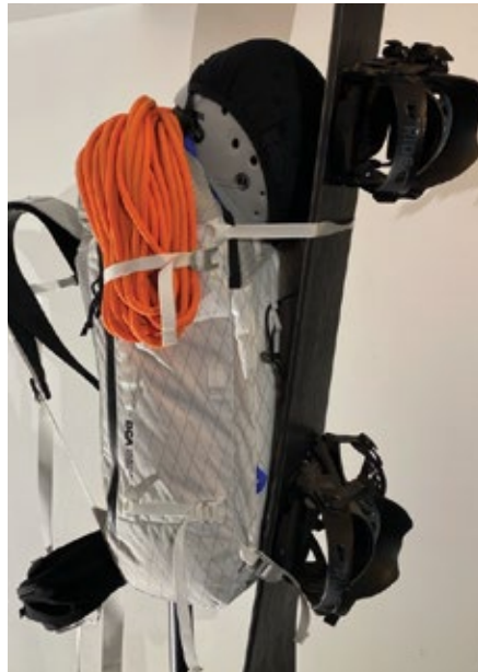
Vertical SNB carry with helmet in upper position and rope - left