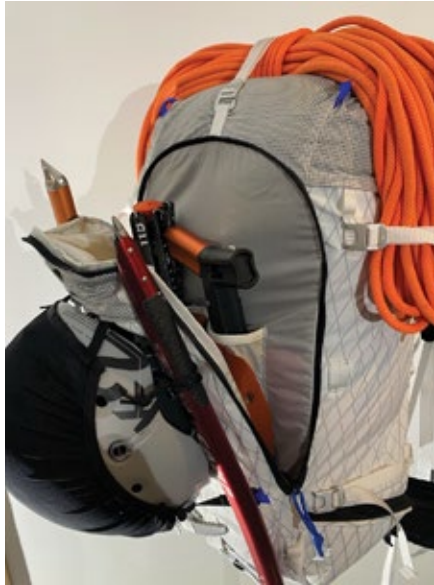
Shovel pocket still easily accessible