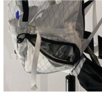
Side Stash Pocket - access items in pack with pack still on