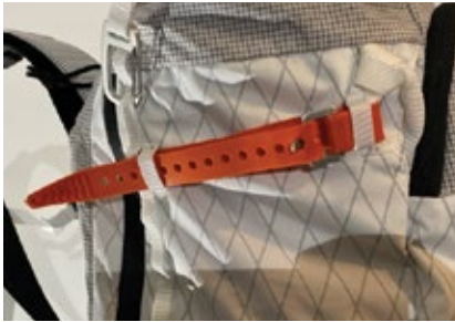
Side anchors compatible with ski straps