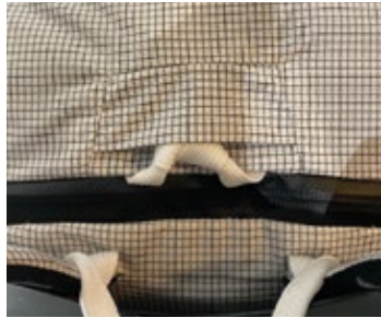
Store rope strap out of the way in radio/hydration port