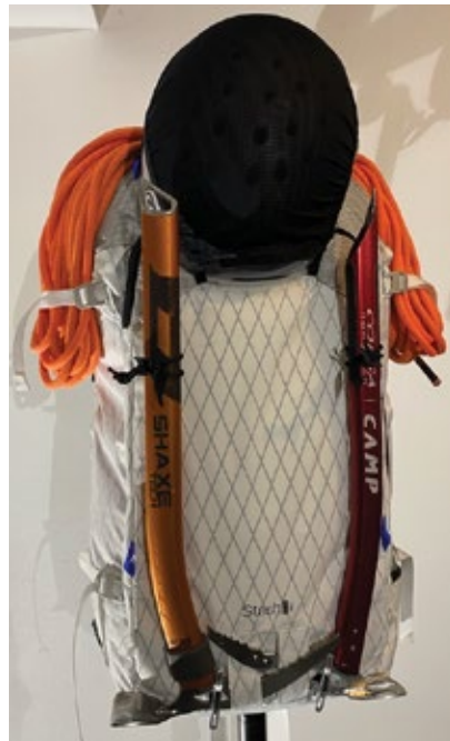
Dual Ice axes with helmet in upper position and rope