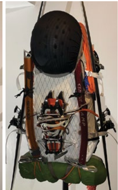
Skis can still fit in A-frame