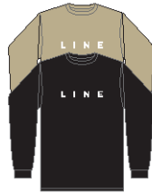
CORPO LS TEE COLORS: BLACK KHAKI