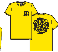
TC TEE COLORS: YELLOW / VAN GRAPHIC