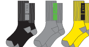
BALLIN SOCKS COLORS: MULTI - BLK/GRY/YLW