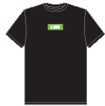
FULL SPEED TEE COLORS: BLACK / NEON GREEN