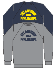
PHYSICAL EDUCATION CREW COLORS: COOL GRAY NAVY