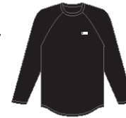
JIB LS TEE COLORS: BLACK