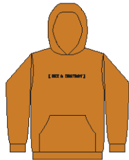
SKI & DESTROY HOODIE COLORS: BURNT ORANGE