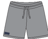
PHYSICAL EDUCATION SHORTS COLORS: COOL GRAY