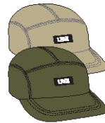
FOREVER 5-PANEL CAP COLORS: KHAKI MILITARY GREEN