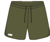
JIB SHORTS COLORS: MILITARY GREEN