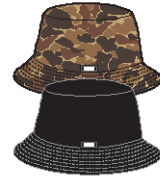
SHADY BUCKET HAT COLORS: BLACK DUCK CAMO