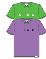
INTERN TODDLER TEE COLORS: NEON GREEN LAVENDER