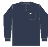
STASH LONG SLEEVE COLORS: NAVY