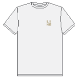
LUXE TEE COLORS: WHITE / GOLD