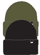
DOCK BEANIE COLORS: BLACK MILITARY GREEN