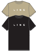
CORPO TEE COLORS: BLACK KHAKI