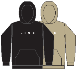
CORPO HOODIE COLORS: BLACK KHAKI