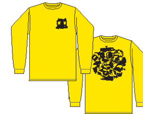
TC LONG SLEEVE COLORS: YELLOW / VAN GRAPHIC