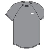
JIB TEE COLORS: COOL GRAY