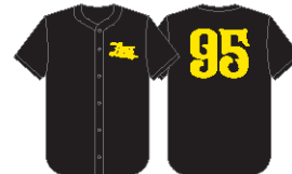
HEAVY HITTER JERSEY COLORS: BLACK