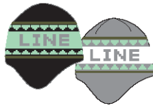
HEATER BEANIE COLORS: BLACK GRAY