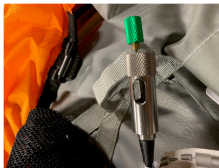
updated Attach Trigger Nut