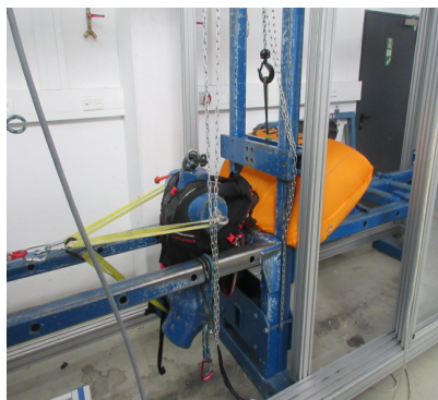
vest with opened airbag (carrying system test)