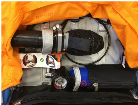
undeployed airbag system with cartridge, Venturi unit and packed airbag