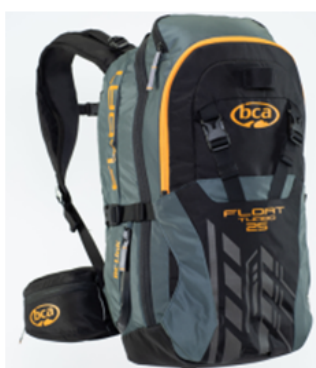
BCA Float Turbo 25: