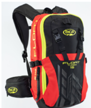
BCA Float Turbo 15: