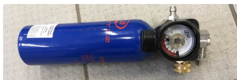
refill-able pressure gas cartridge with valve (including pressure gauge) and cylinder